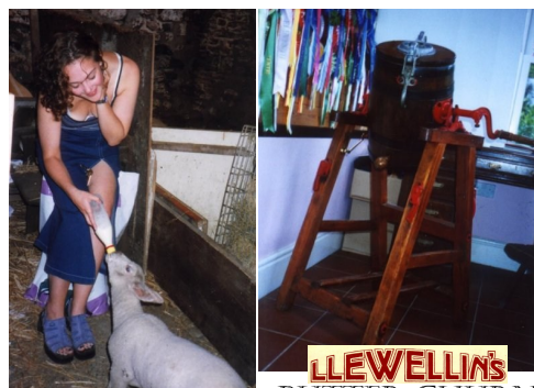
Visitors of all ages can feed the orphan lambs in season