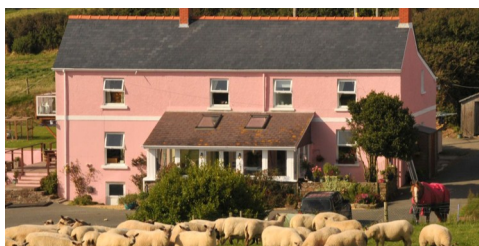
'Croeso y Bower' Where you'll feel at home