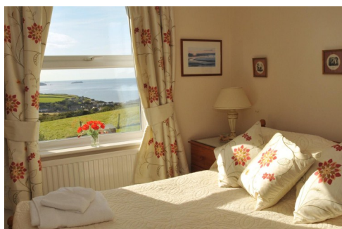
Wake up where the sea sparkles in the sun !